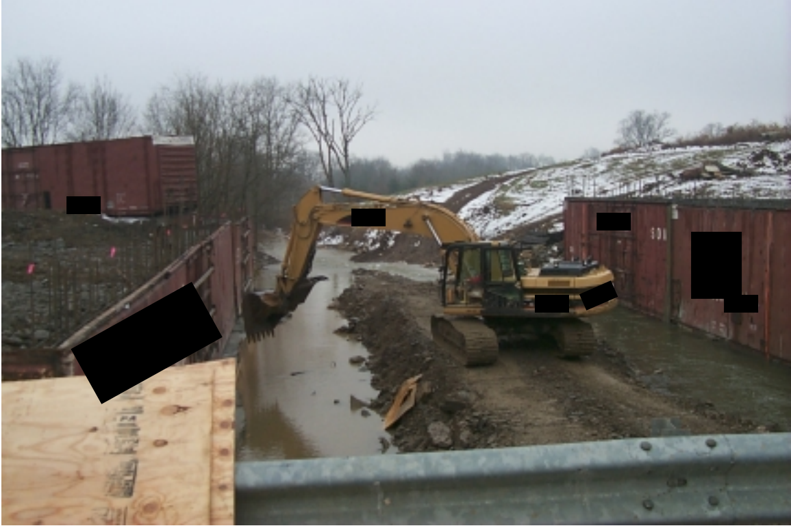
Picture of track hoe used to pull concrete away from worker.