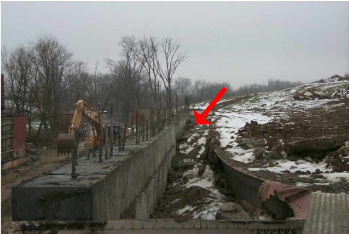
Location where incident occurred. Actual location is at the bottom of this form.