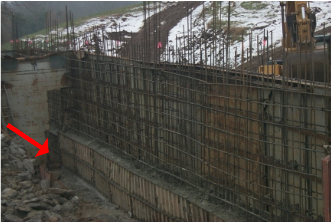
Picture of the opposite form being poured. This is how the other side looked when forms broke, trapping a worker waist high in cement.