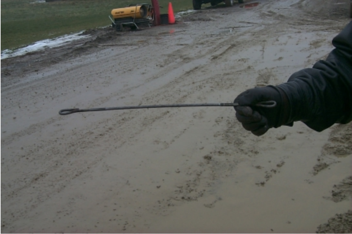
Picture of wire used for horizontal stability of concrete form.