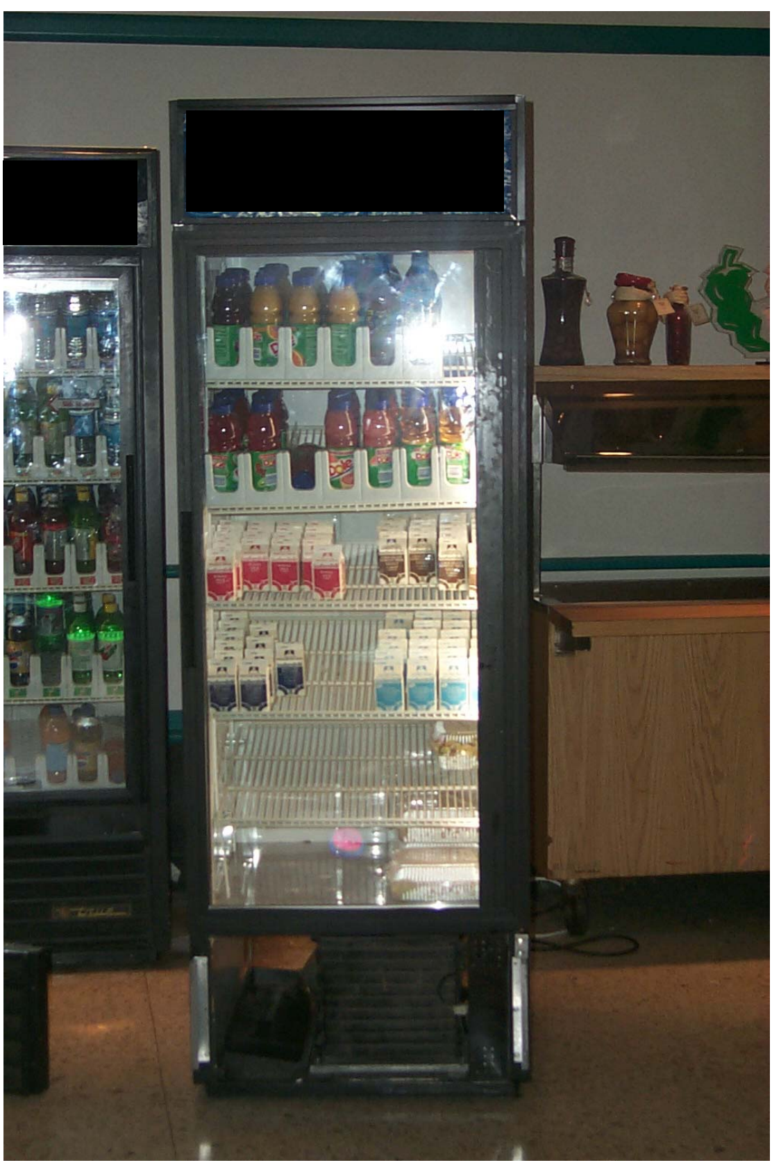
Cooler similar to the one in the restaurant.