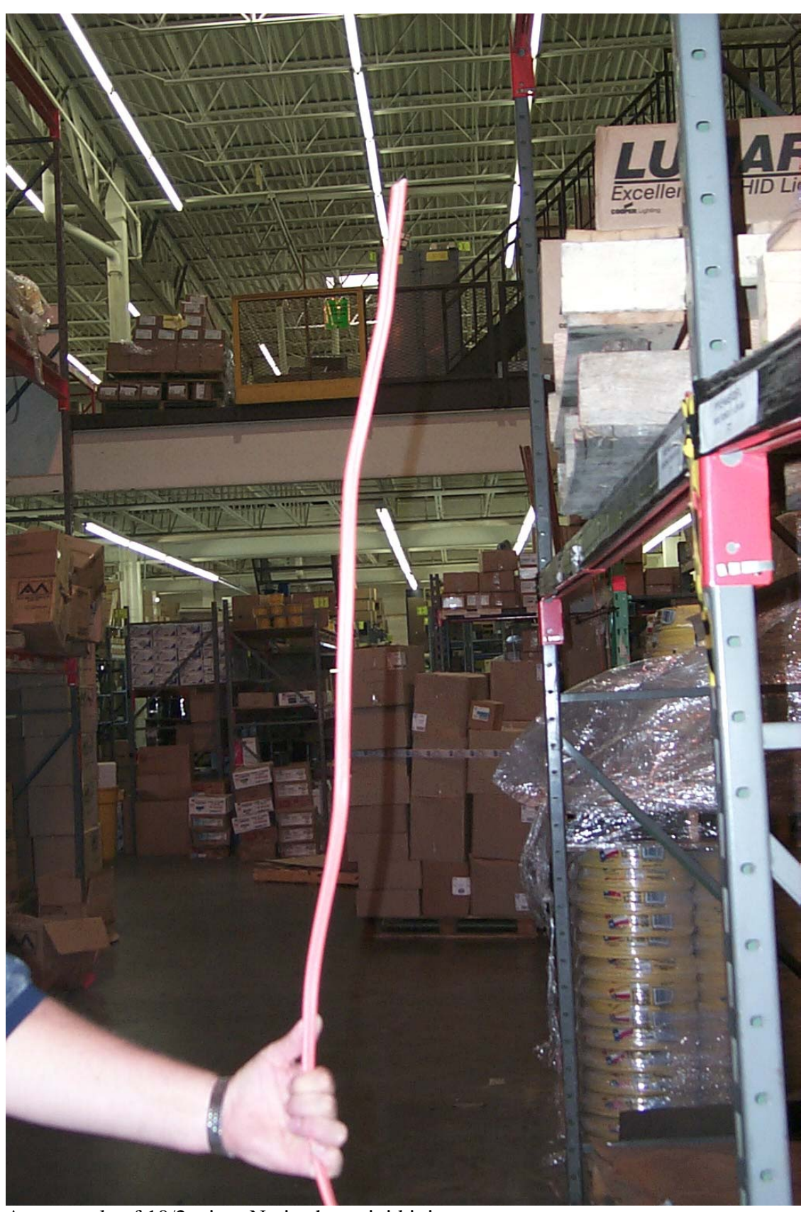
An example of 10/2 wire. Notice how rigid it is.