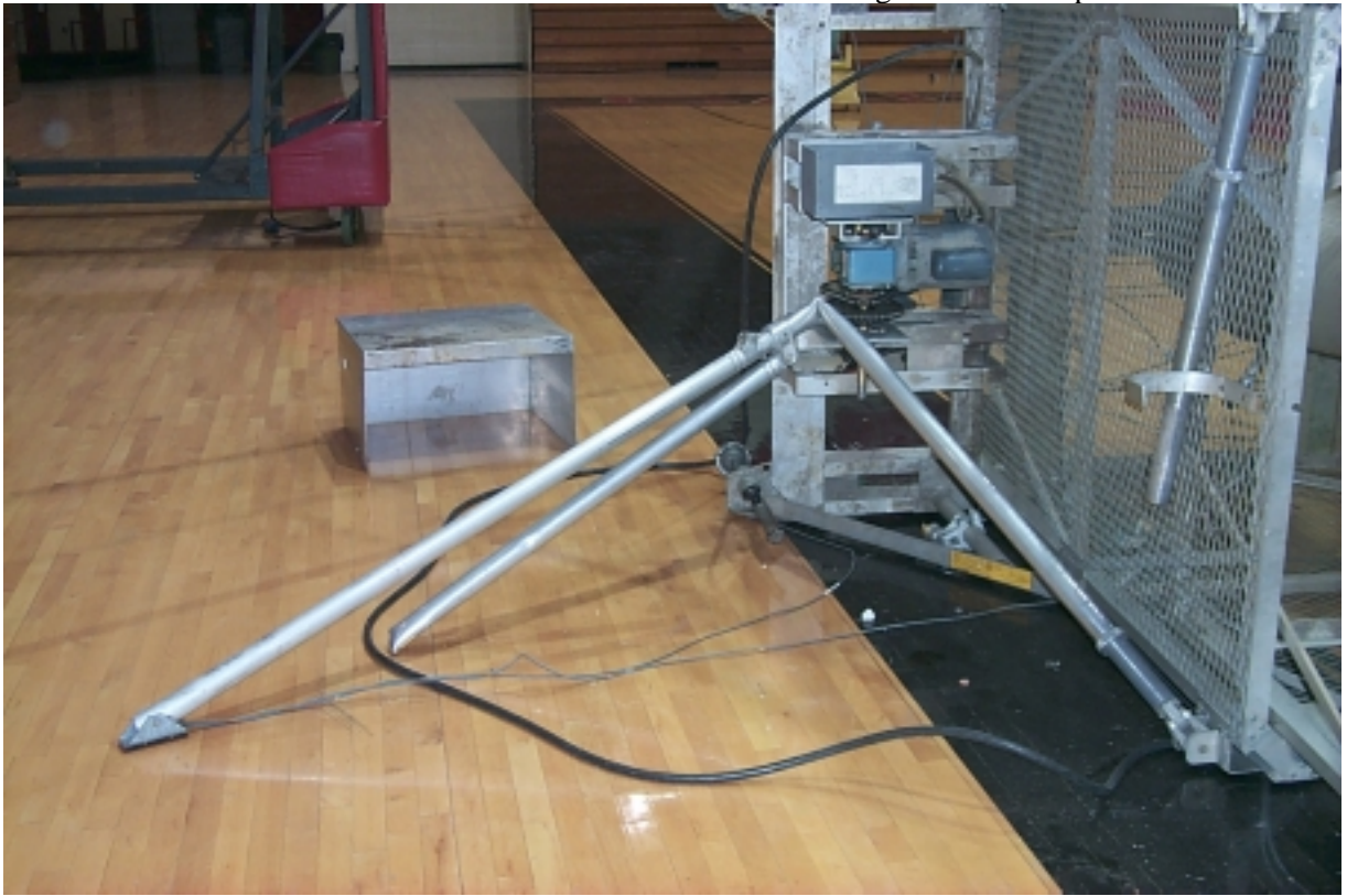
Picture of control ground control panel on its side and outrigger used to stabilize the lift. Notice it had been extended for use.

Picture of lift on its side from the basket end to the base end where ground control panel was located.