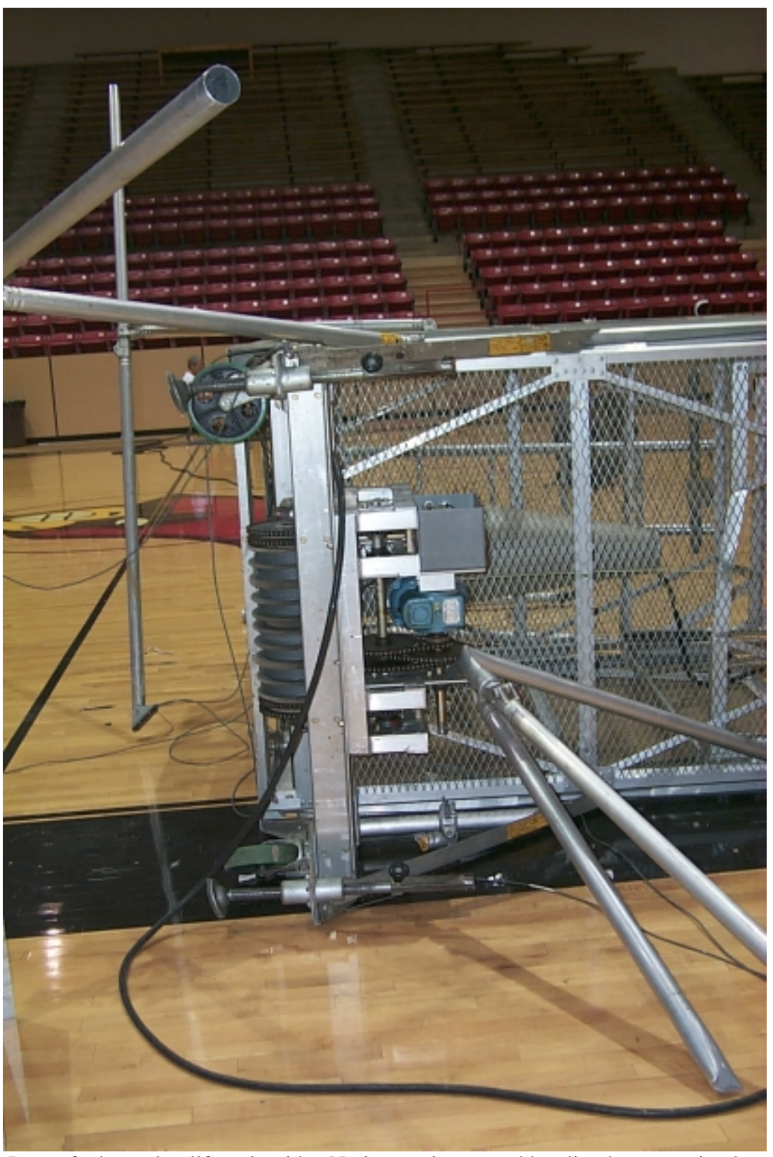
Base of telescoping lift on its side. Notice outriggers and leveling legs were in place to balance the lift.