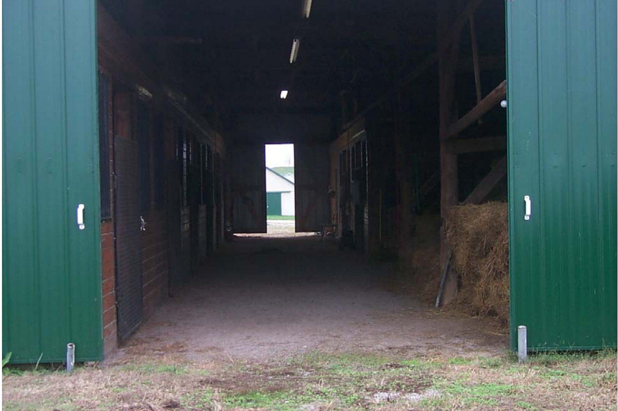
Photo of barn where incident occurred. Both sets of doors were closed at the time of the incident.