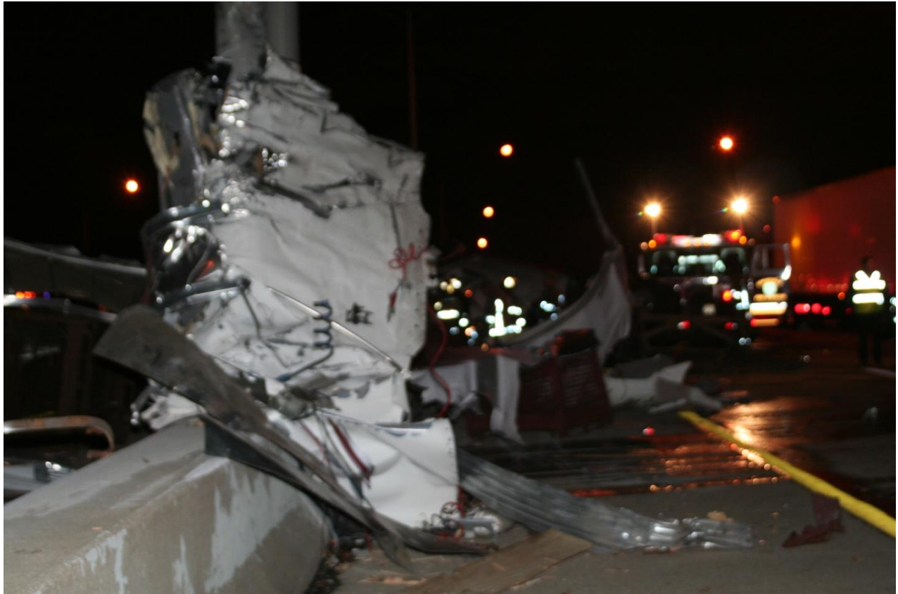
Photograph of trailer wrapped around sign pole.

The Kentucky Fatality Assessment & Control Evaluation Program (FACE) is funded by a grant from the Centers for Disease Control and the National Institute of Safety and Health. The purpose of FACE is to aid in the research and prevention of occupational fatalities by evaluating events leading to, during, and after a work related fatality. Recommendations are made to help employers and employees to have a safer work environment. For more information about FACE and KIPRC, please visit our website at: www.kiprc.uky.edu