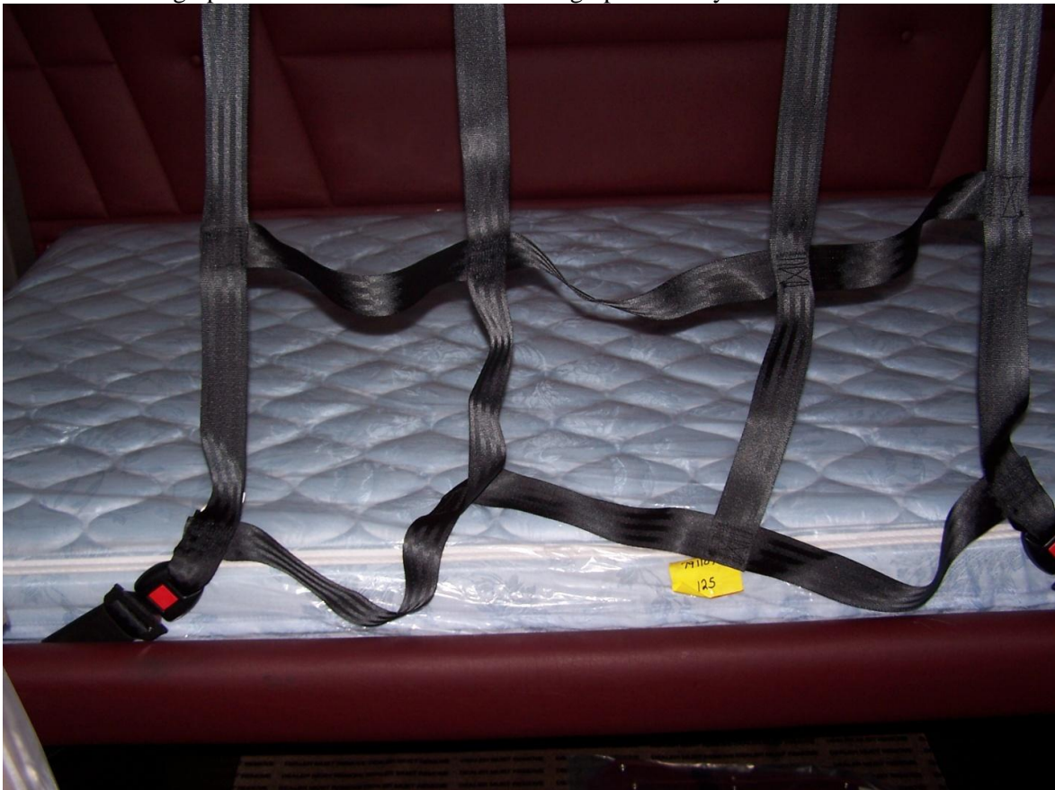
Photograph of a restraint system in a similar sleeper berth.