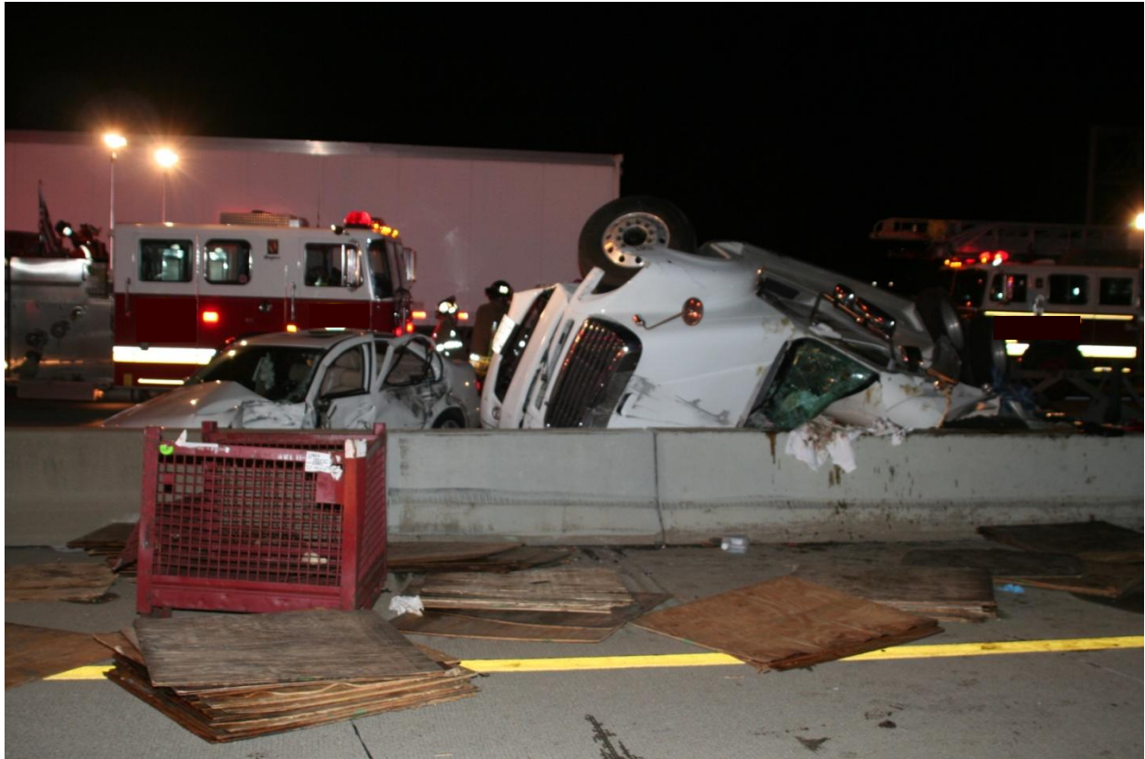
Photograph of semi and car involved in fatal crash.

Kentucky Fatality Assessment and Control Evaluation Program Kentucky Injury Prevention and Research Center 333 Waller Avenue Suite 206 Lexington, Kentucky 40504 Phone: 859-323-2981 Fax: 859-257-3909 www.kiprc.uky.edu