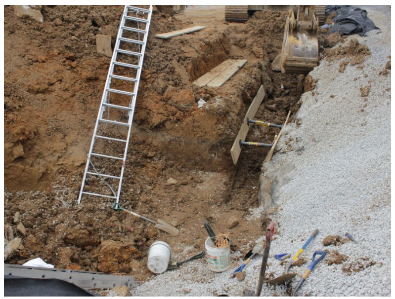
Figure 2. View looking down at the trench containing a mixture of class B and C soils on the right side of the trench near the concrete wall. Class B soil is observed on the opposite side of the trench.

The soil along the concrete wall facing the side of the trench was a mixture of class B and class C soil, along with #57 gravel backfilled along the wall foundation (figure 2). The soil surrounding the base of the concrete wall had previously been disturbed during the wall's construction. The spoil pile was placed on the roadfacing side of the trench at the required 2 foot minimum distance, however, this was still unsafe due to the pile's size and the lack of a trench protection system.