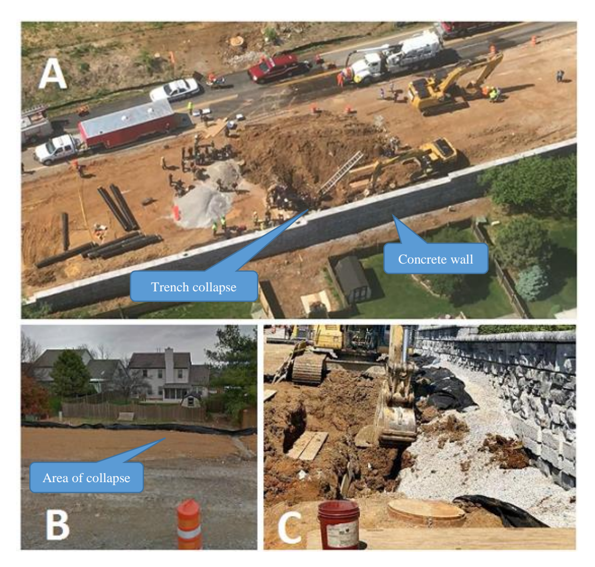
Figure 1. A) Aerial view of incident scene, B) photo of trench collapse location 4 months prior to incident, C) section of trench that collapsed on victim; concrete wall.

The incident took place along a two-lane highway construction site where the two-lane highway was being widened. Running parallel at a distance of 45-50 feet from the road was a concrete wall that had been recently erected to separate the widened road from an adjacent residential neighborhood (Figure 1A). In preparation for a sewage pipeline to be laid, a trench measuring approximately 13.4 feet deep was being excavated parallel to the concrete wall (Figure 1C). The distance between the section of the trench that collapsed and the concrete wall was estimated to be approximately 4-5 feet.