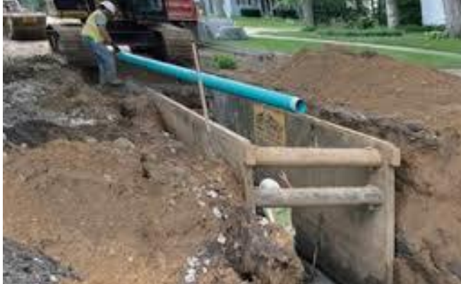
Figure 6. Stock photos of trench shoring (left), trench box (right).