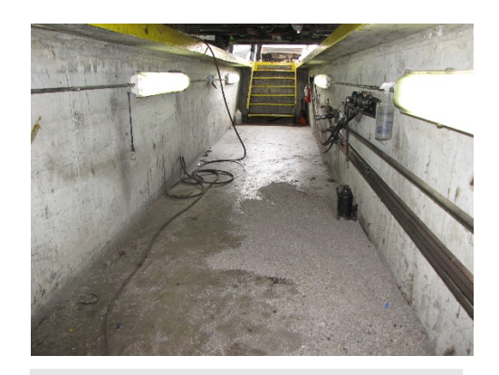
Figure 4. View of the pit in which the victim was working at the time of the incident.

The incident took place in a concrete pit, which was approximately 5 feet deep and 4 feet wide, and located in the floor of the building. This pit allowed access to the undercarriage of the trucks while allowing employees to remain in a standing position. Both mechanics, the victim and his coworker were working in this area when the incident occurred.