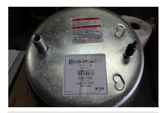
Figure 2. Sample of a new air suspension air bag to be installed.

Equipment involved includes Continental Conti-Tech Air Spring 9 10S-16 P 382 suspension air springs and a shop air pressure system. A Sterling L Series Tractor Trailer was the vehicle on which the air springs were being installed.