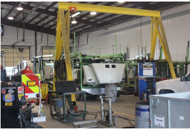
Figure 3. The tractor-trailer the installation was taking place.