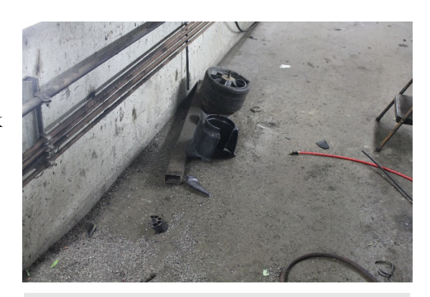
Figure 1. Left side air spring after the explosion.

Employers should enforce the use of manufacturer's instructions and specifications when replacing suspension air springs.