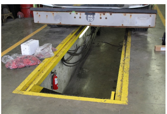
Figure 5. View of the pit from above.