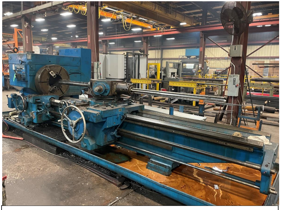
Photo 1. Photo showing involved manual lathe and facility floor/layout in the background.