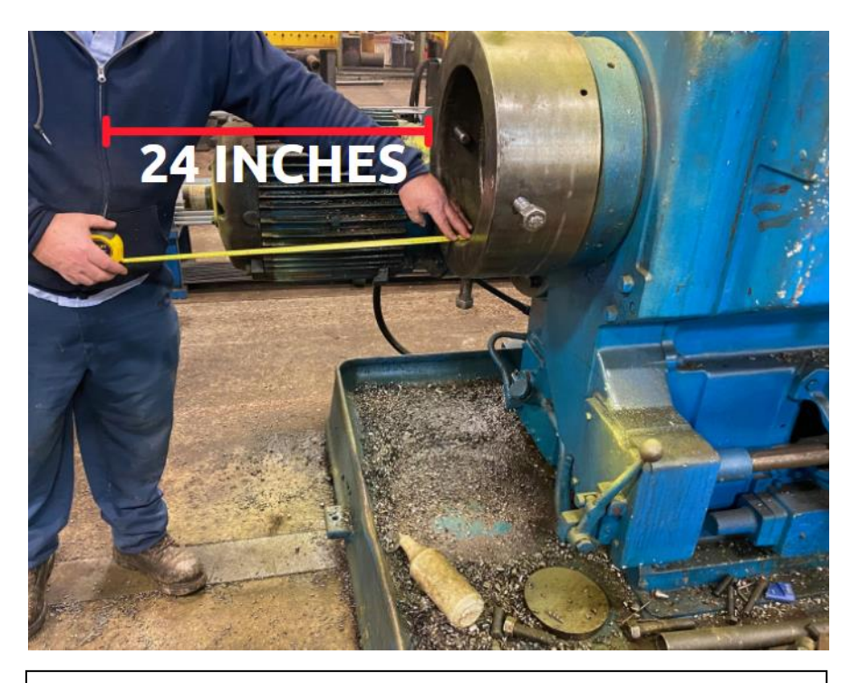
Photo 3. Photo showing the involved manual lathe. The steel rod protruded from the rear of the machine approximately 24 inches. The red line depicts how far the steel was protruding from the end of the lathe.