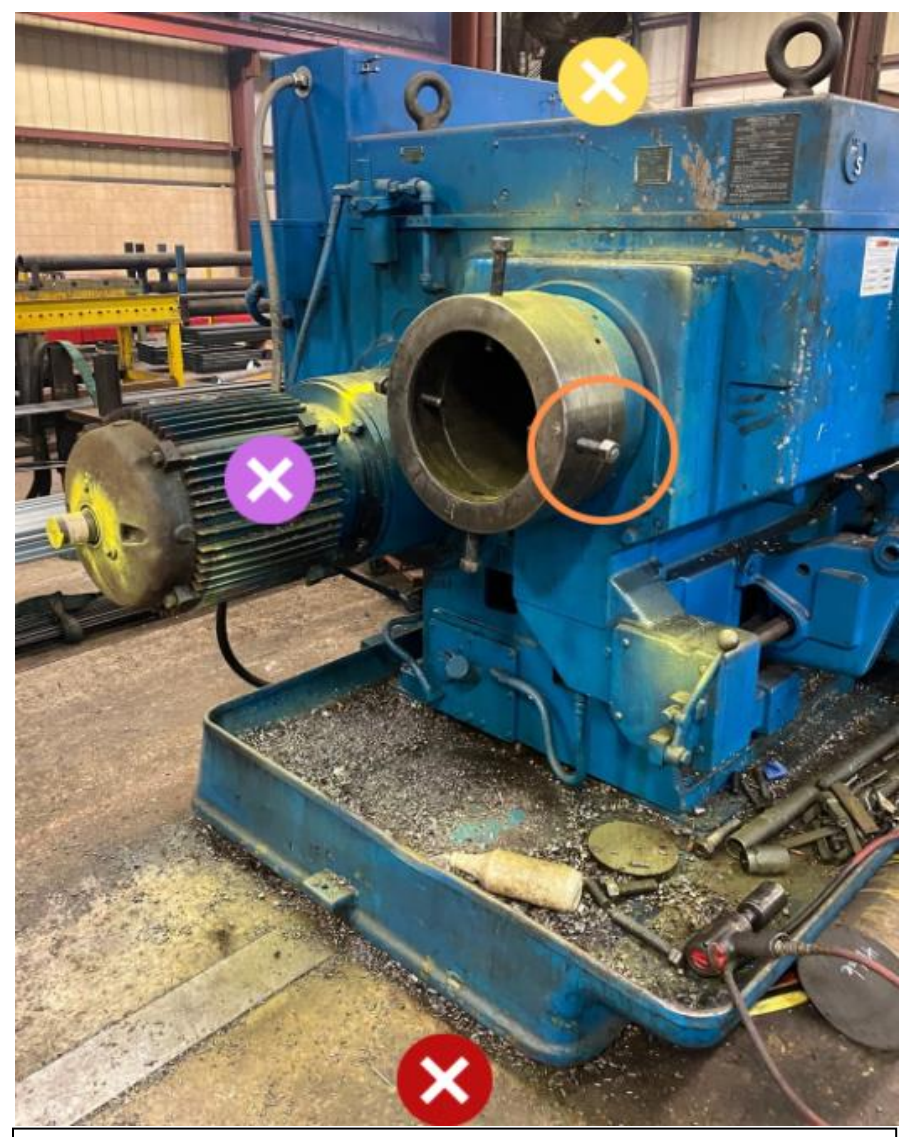
Photo 5. The red X indicates the position of the victim when he attempted to reach on top of the machine. The yellow X indicates the location believed to be where the glove was located. The purple X represents the lathe motor which the victim struck multiple times after becoming entangled. The orange circle is highlighting the chuck which caught the victim's clothing.