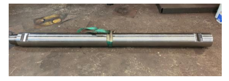
Photo 4. Photo showing similar piece of steel that was being machined when the incident occurred. Photo is property of KY FACE.

Photo 3. Photo showing the involved manual lathe. The steel rod protruded from the rear of the machine approximately 24 inches. The red line depicts how far the steel was protruding from the end of the lathe. Photo is property of KY FACE.