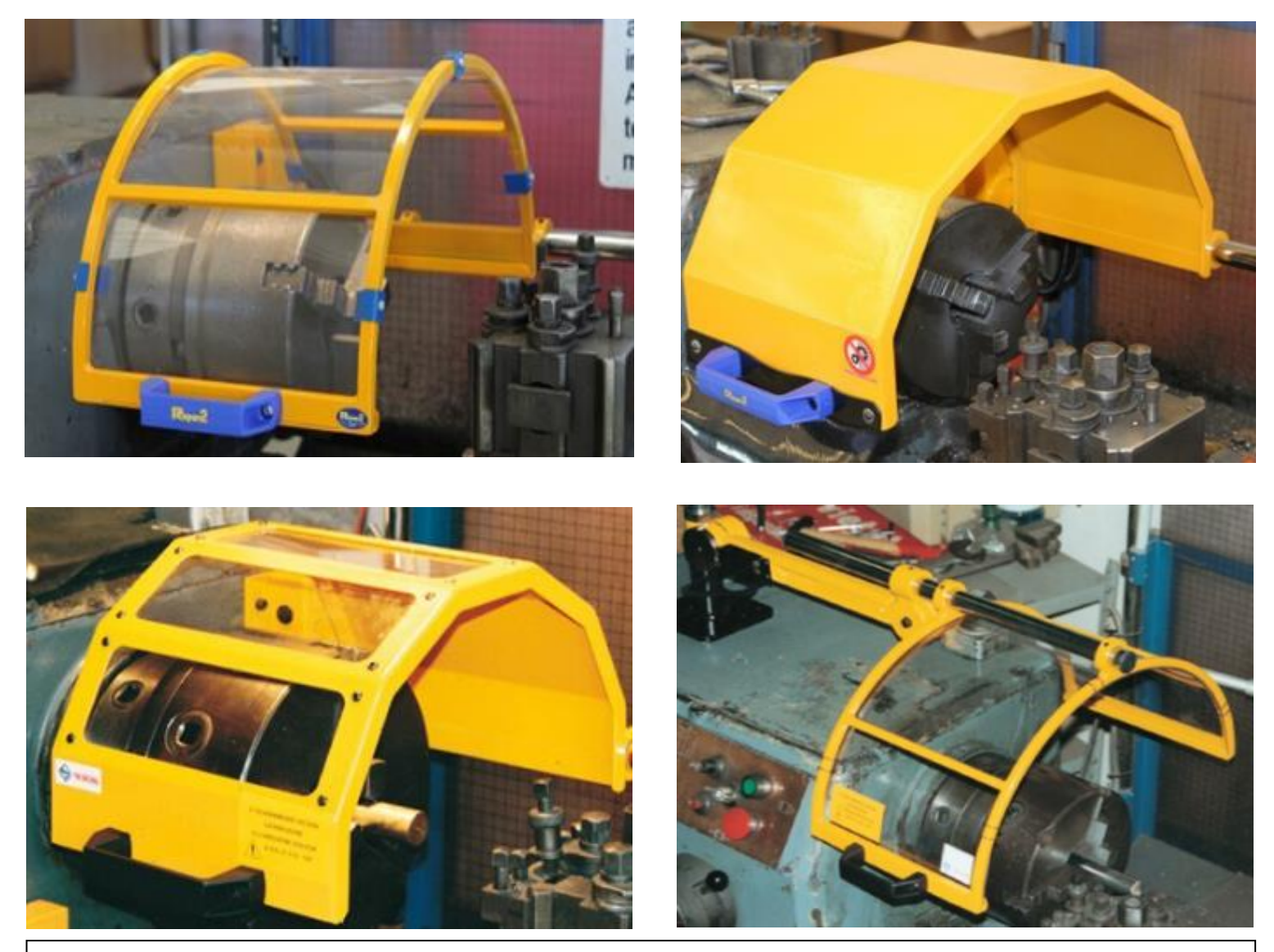
Photo 6, 7, 8 & 9. Examples of aftermarket guarding systems on similar machines.<sup>4</sup>

Although retrofitting aftermarket guarding can be difficult, OSHA stated in a letter of interpretation that the agency encourages the development of safety devices that will eliminate hazard exposure to employees. The company should purchase aftermarket guards for all unprotected machinery or fabricate their own guards for both the front and rear of each machine and have them tested by a nationally recognized testing laboratory.