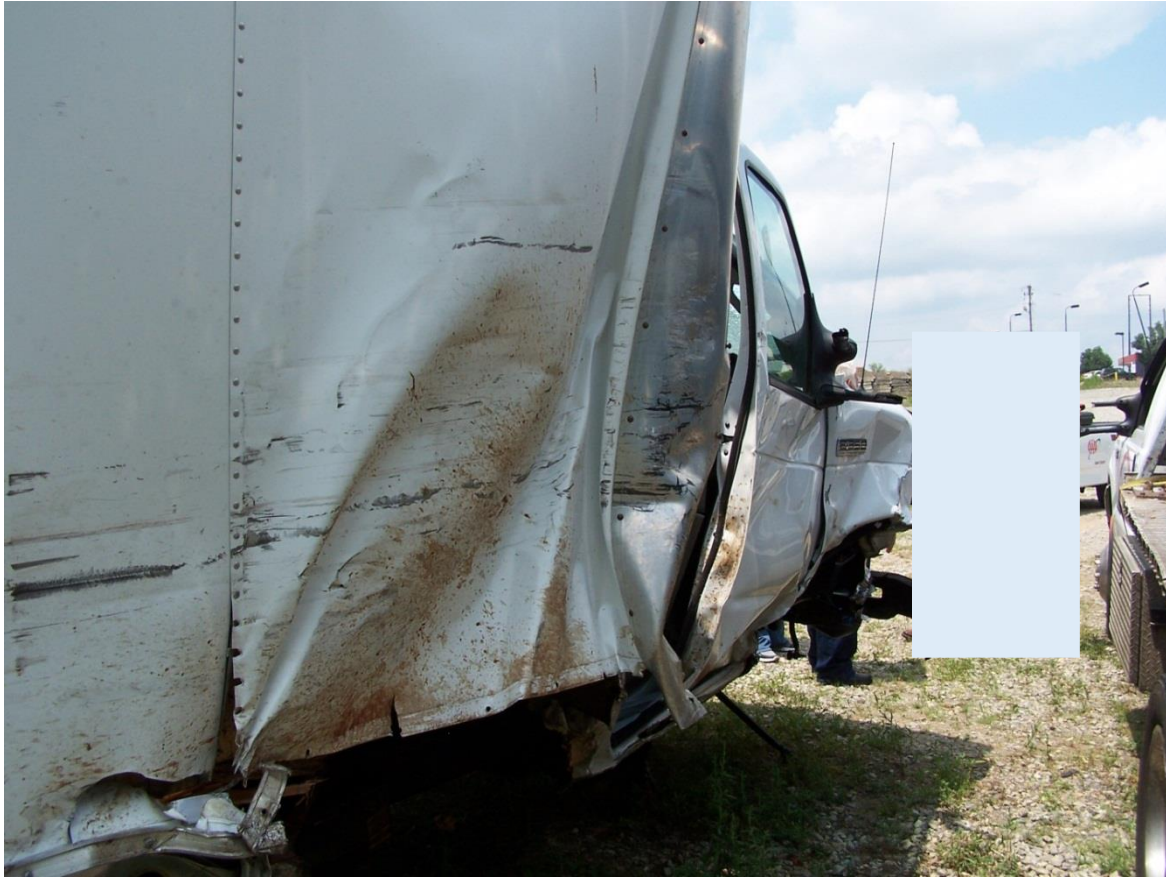
The box truck that struck the tow truck.