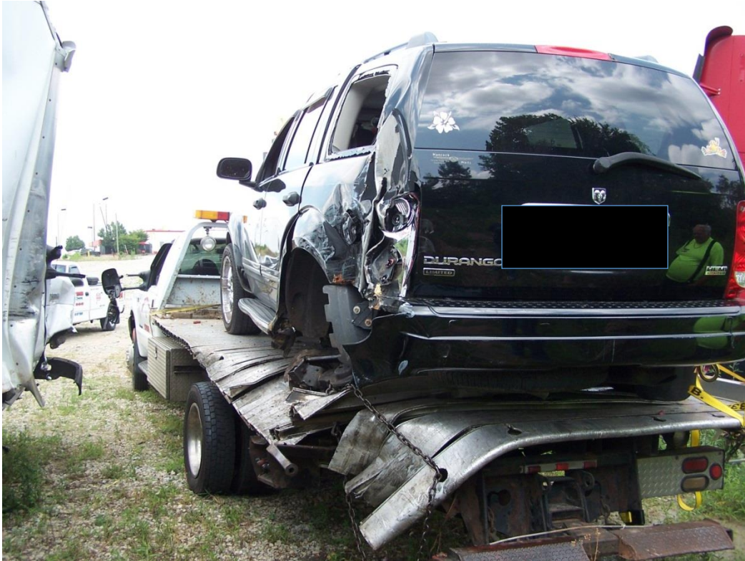
The tow truck with SUV.