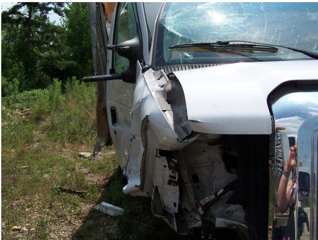
The box truck that struck the tow truck.