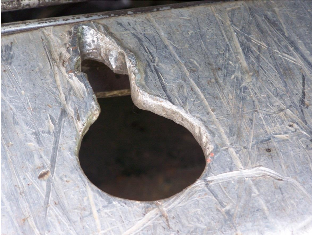
A worn securement site on the tow truck.