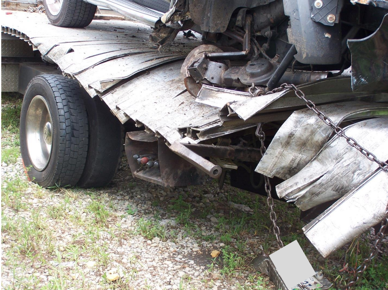
The tow truck struck by the box truck.

Kentucky Fatality Assessment and Control Evaluation Program Kentucky Injury Prevention and Research Center 333 Waller Avenue Suite 242 Lexington, Kentucky 40504 Phone: 859-323-2981 Fax: 859-257-3909 www.kiprc.uky.edu