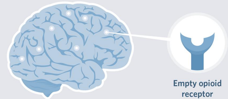
Empty opioid receptor