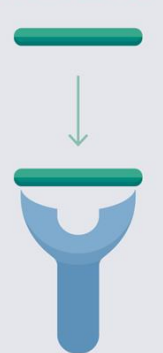
Antagonist: Blocks effect