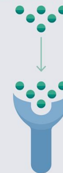
Partial agonist: Generates limited effect